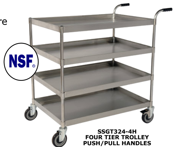
SSGT324-4H FOUR TIER TROLLEY PUSH/PULL HANDLES