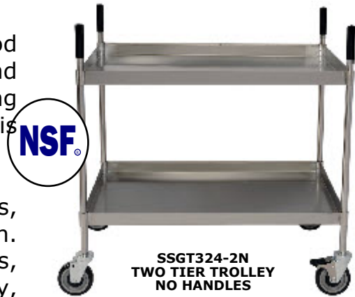
SSGT324-2N TWO TIER TROLLEY NO HANDLES

All trolleys are dispatched in easy to handle and store cartons ready for on site assembly.