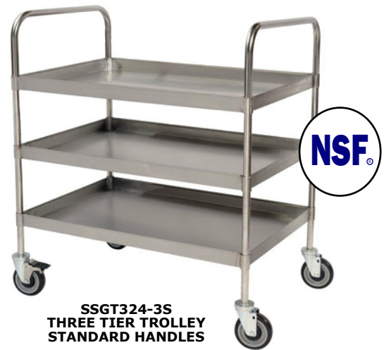
SSGT324-3S THREE TIER TROLLEY STANDARD HANDLES